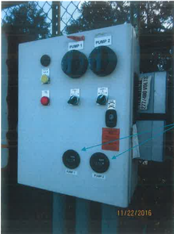
Photograph 1 – Pump run-time meters