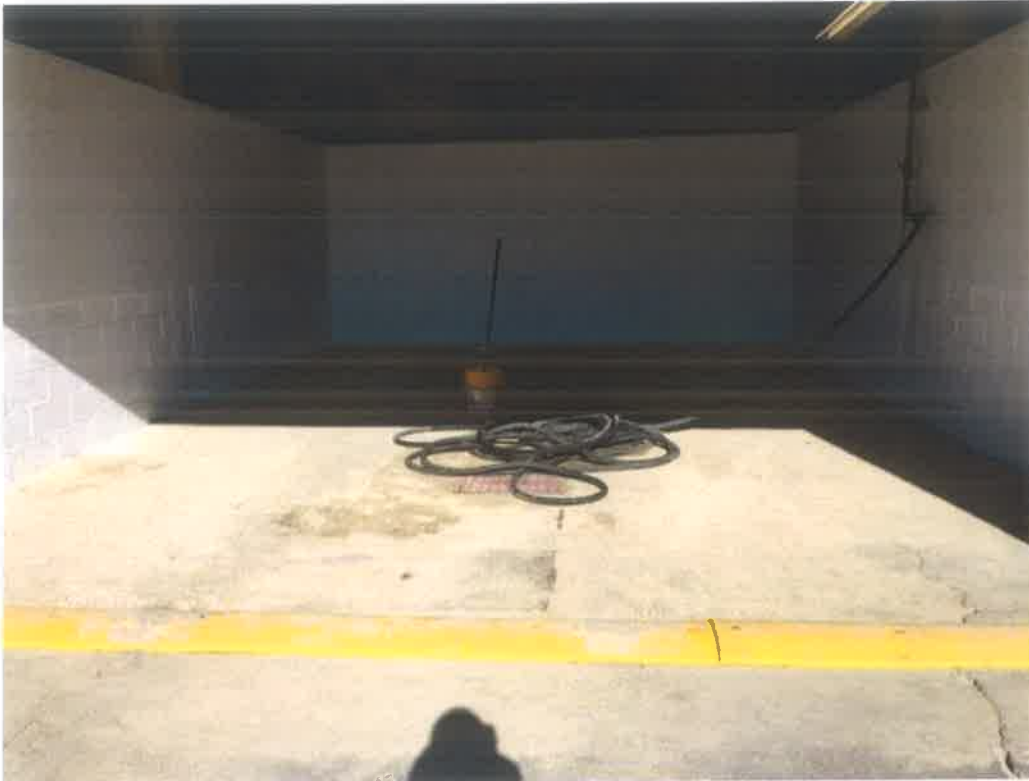
Photograph 3 – New equipment wash bay.