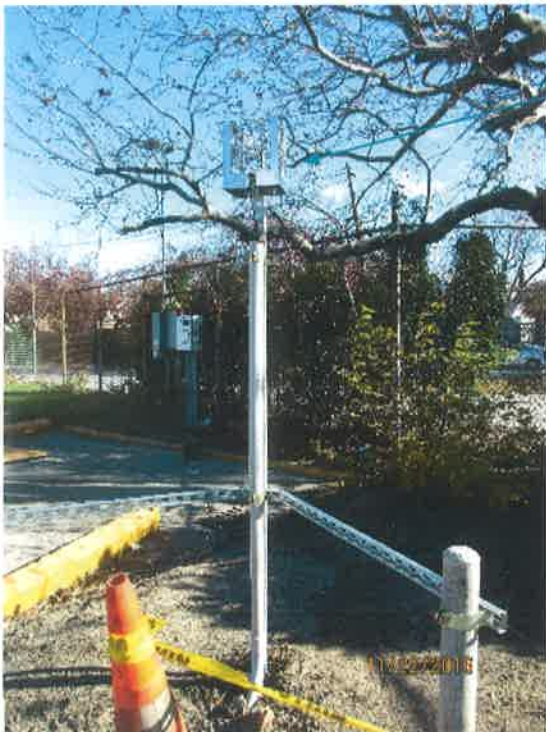
Photograph 2 – Solar powered wet sensor electronic housing