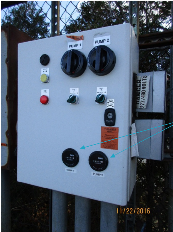
Photograph 1 – Pump run-time meters