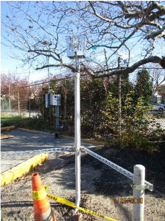
Photograph 2 – Solar powered wet sensor electronic housing